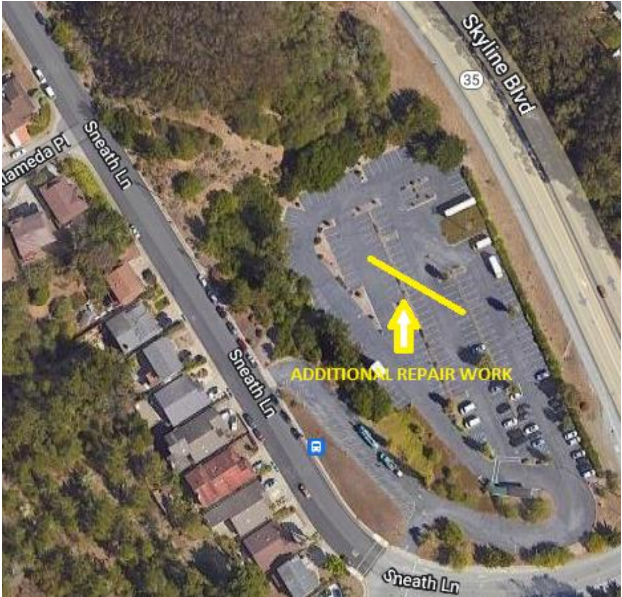
Attachment 2 – Location Map