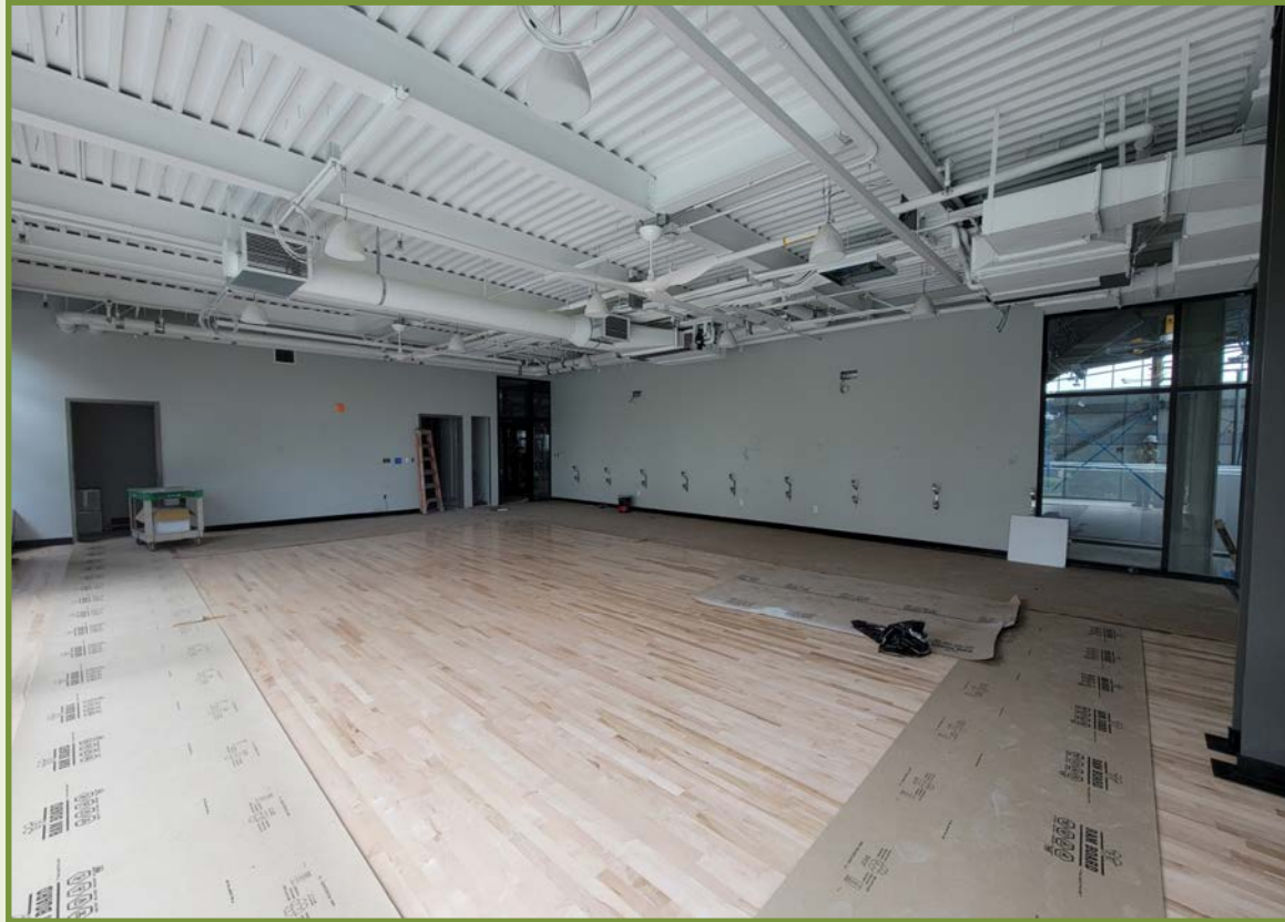
Group Exercise Room