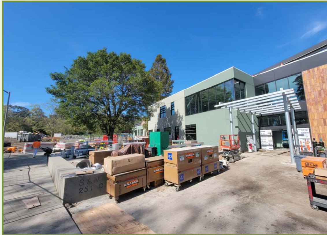
PLAZA / MAIN ENTRANCE