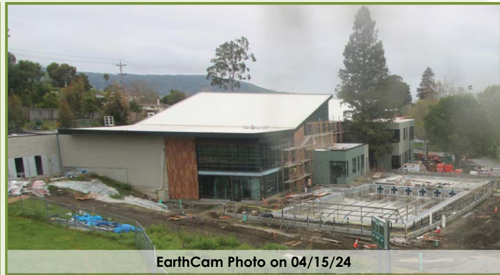
EarthCam Photo on 04/15/24