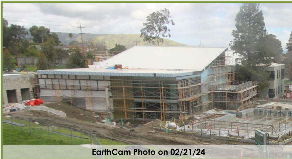
EarthCam Photo on 02/21/24