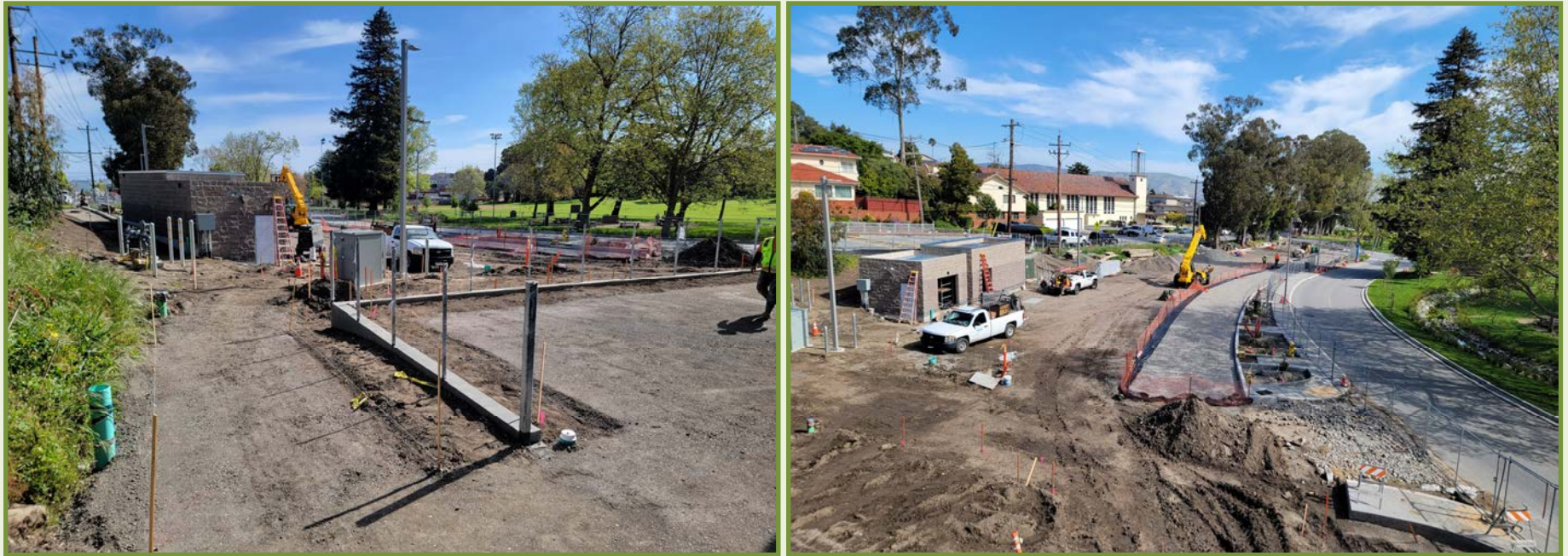
KID'S PLAY AREA/PARKING LOT/CITY PARK WAY